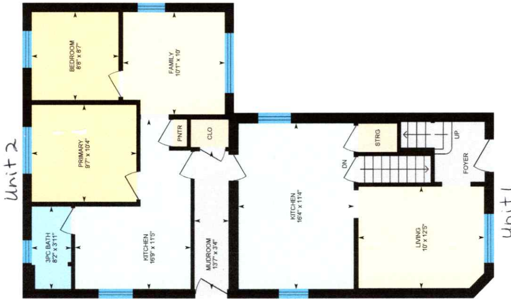
Main Floor Exterior Area 1070.21 sq ft

Main Building: Total Exterior Area Above Grade 1535.67 sq ft