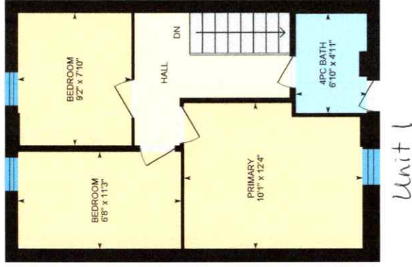
2nd Floor Exterior Area 465.46 sq ft